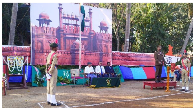
Welcome Speech by ANO