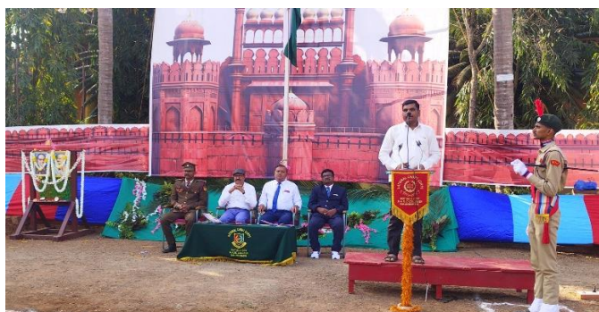
Vote of thanks