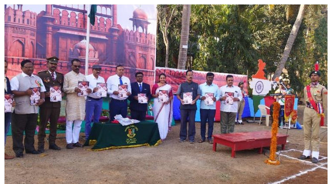
Magazine Releasing Ceremony